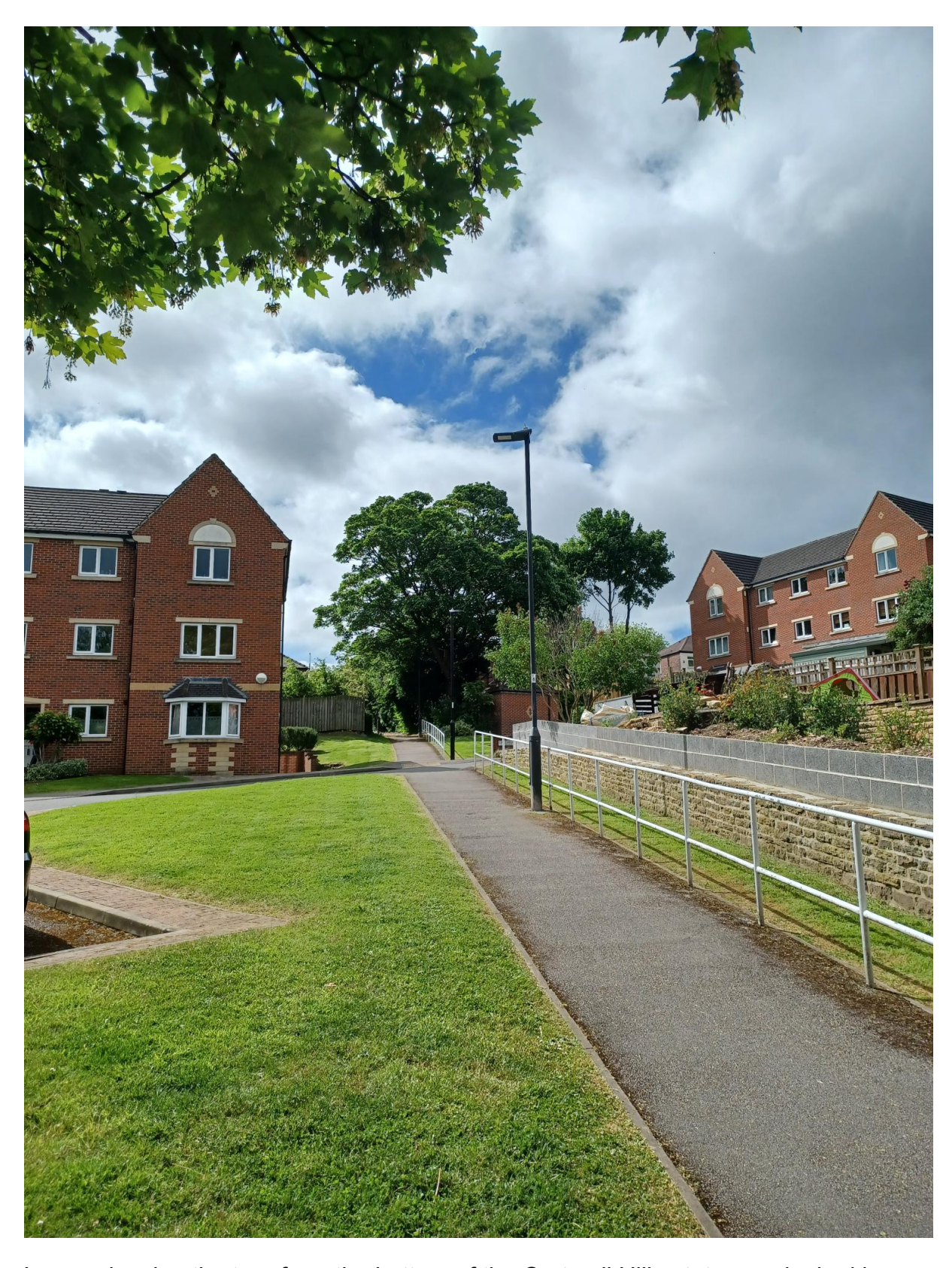
Image showing the tree from the bottom of the Cartmell Hill estate, overlooked by two flat complexes.