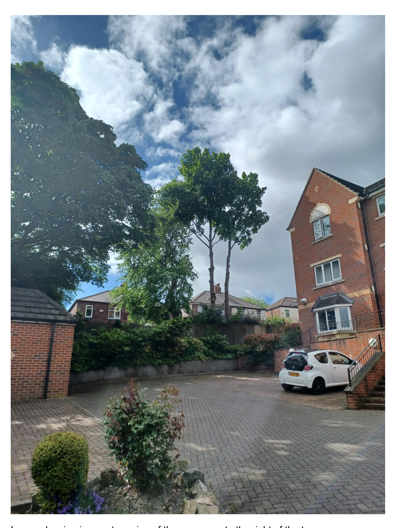
Image showing inexpert pruning of the sycamore to the right of the tree.